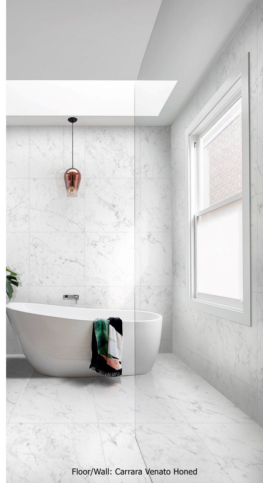
Floor/Wall: Carrara Venato Honed