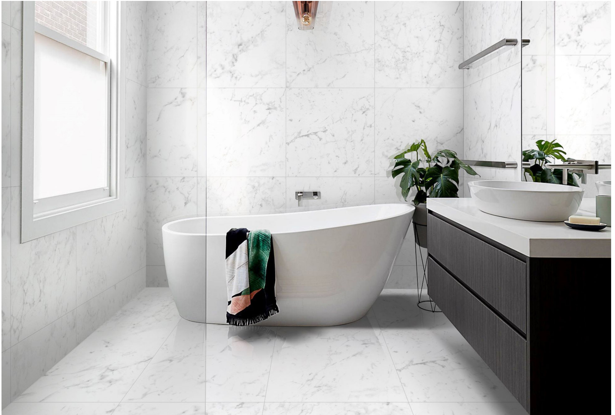
Floor/Wall: Carrara Venato Honed