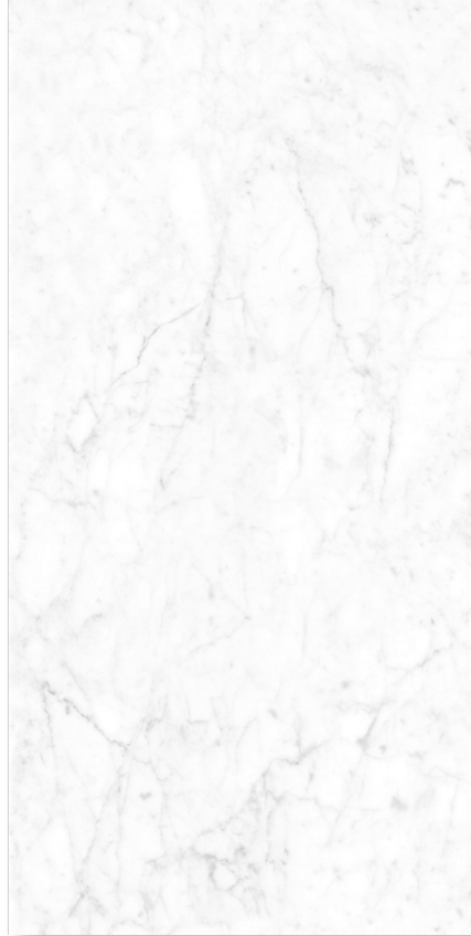
EST0109 Carrara Venato Polished 600x1200mm