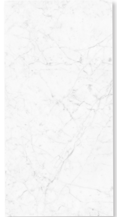
EST0110 Carrara Venato Honed 600x1200mm