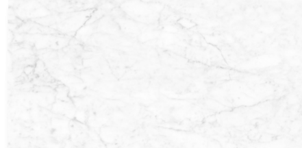
EST0118 Carrara Venato Honed 300x600mm