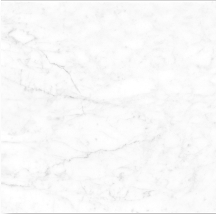
EST0107 Carrara Venato Polished 600x600mm