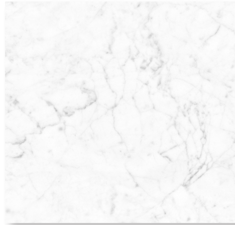
EST0108 Carrara Venato Polished 600x600mm