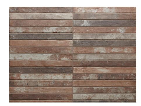
Red White Brick