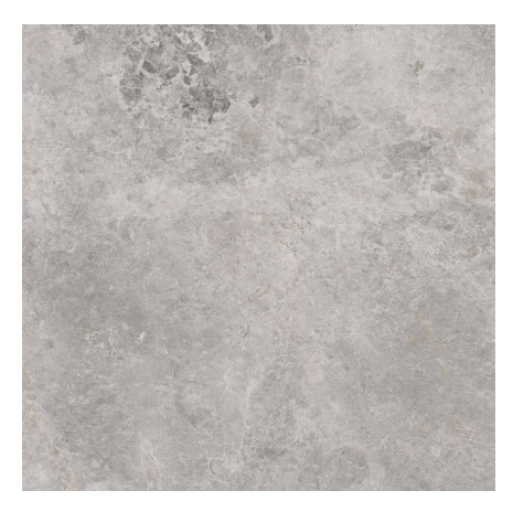
ART0001 Tundra Grey Ocean 600x600x10mm