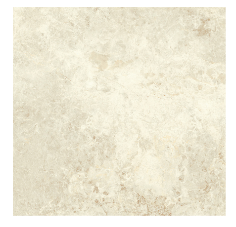
ART0002 Tundra Sand Ocean 600x600x10mm