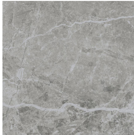
PAM0024 Stone Grigio Satin 600x600mm 8 Faces