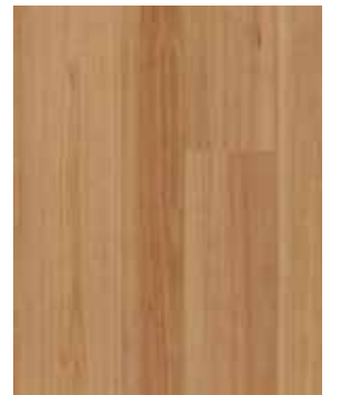
Blackbutt Product Code 702