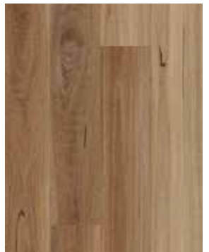
Spotted Gum Product Code 701